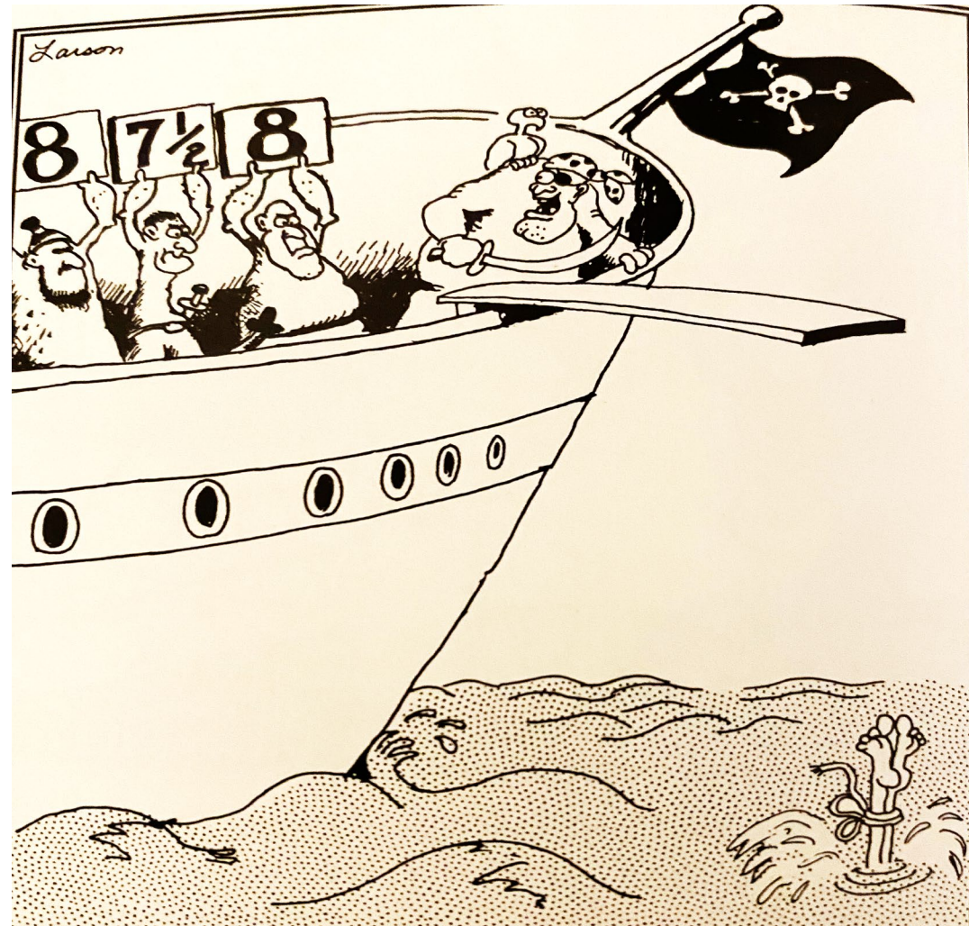
Gary Larson: The Far Side