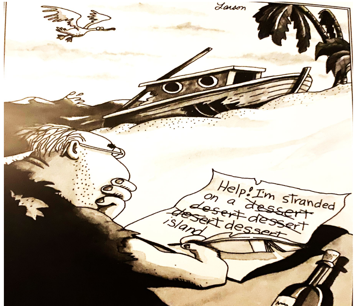
Gary Larson: The Far Side